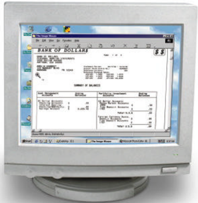
Computer system sold separately