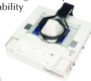
Computer system sold separately.

The ImageMouse Plus® carriage gives you cost-effective microfiche scanning with superior stability